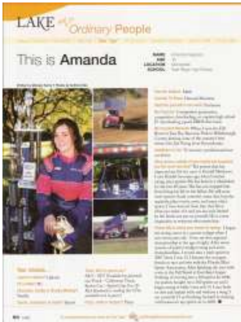
Lake Magazine, March 2009