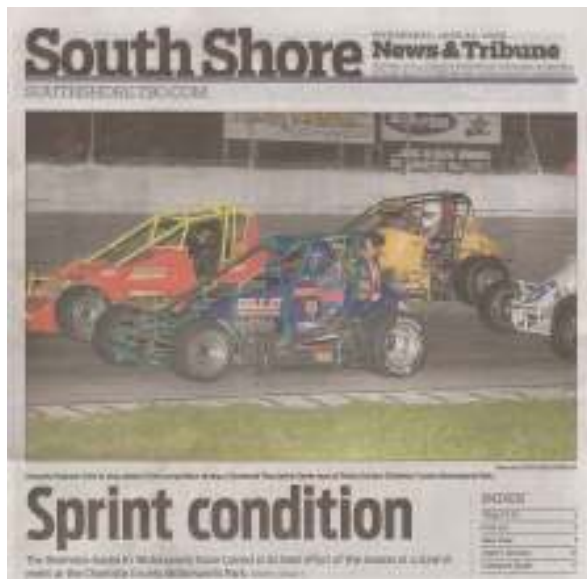
South Shore News (Tampa Tribune) June 24, 2009