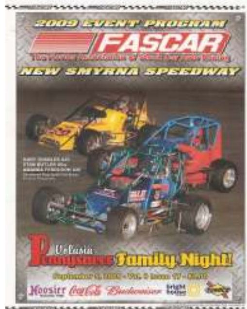
FASCAR Program September 5, 2009