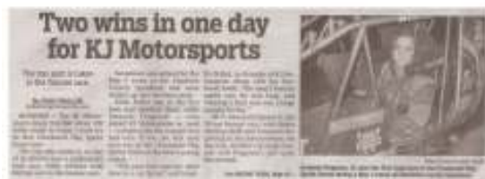
Tampa Tribune, May 13, 2009